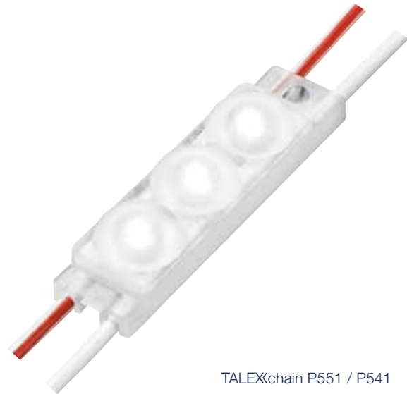
TALEXchain P551 / P541